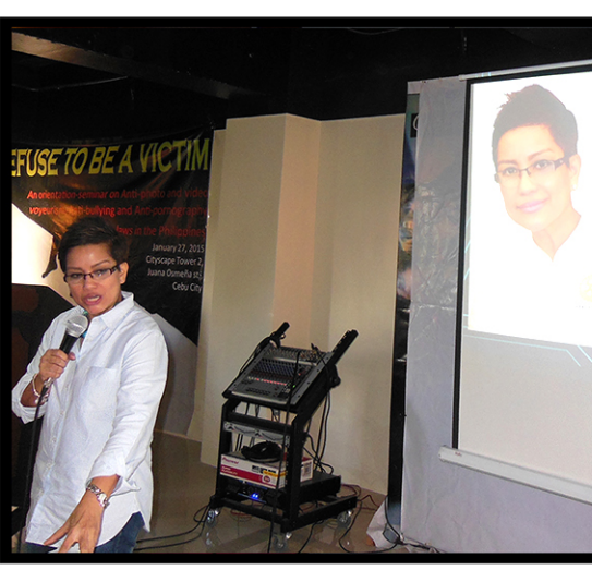
Spread the Word!